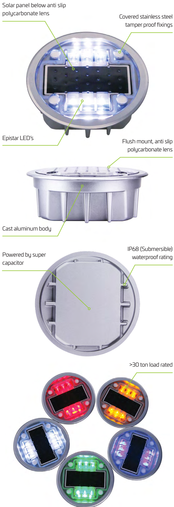
Various colour options available, in static or flashing modes