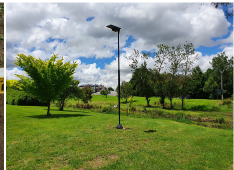
6. Once concrete has fully dried (24h min), the foundation cage can be used to erect the lighting column