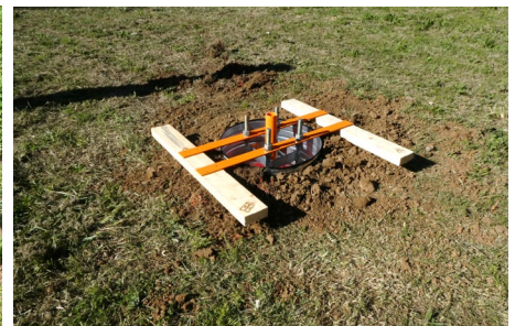
3. Position cage, template, and conduit as required.

WARNING: Cover all exposed holes and fence off the area with high visibility fencing