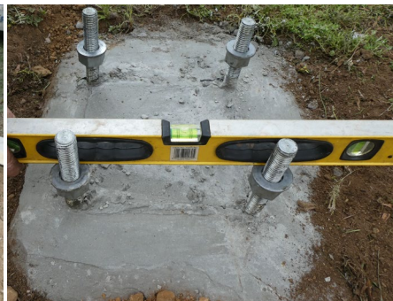
5. Finish and fence off foundation