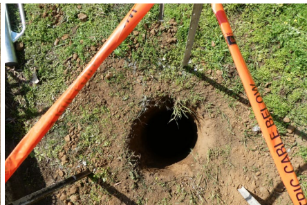
2. Auger 450mm x 1200mm hole