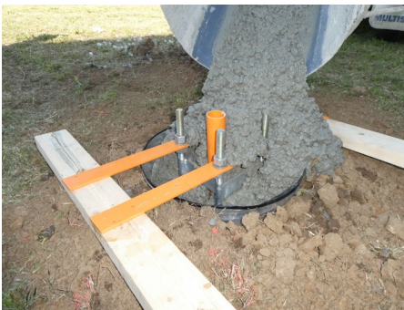
4. Pour concrete - During the pour continuously vibrate concrete.

WARNING: Cover all exposed holes and fence off the area with high visibility fencing