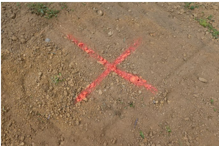
1. Mark pile location