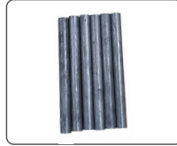
02 : Ring Spacer Tubes ( 6 pcs )