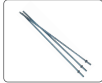
01 : Threaded rod with welded nuts ( 3 pcs )