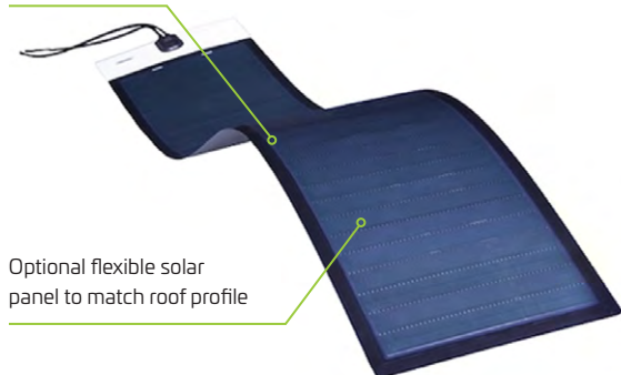
Optional flexible solar panel to match roof profile