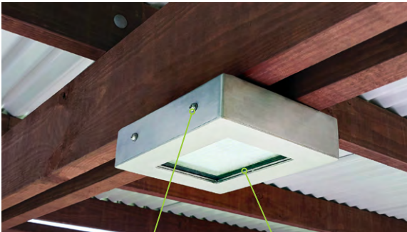
Stainless steel tamper proof fixings